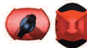
• MIRG “Work Restraint” block (Checkmate Xcalibre)