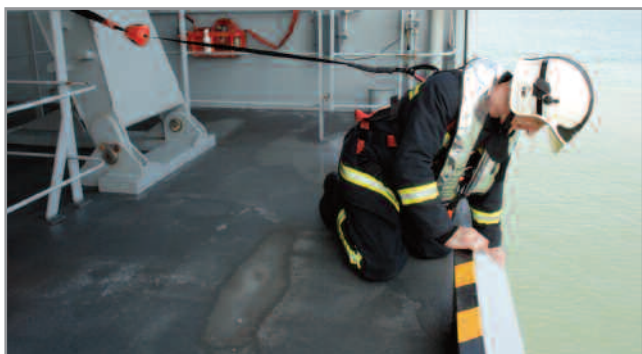
• MIRG “Work Restraint” device in use (during trials in Hampshire)

IN ADDITION TO THE FALL ARREST DEVICE for climbing ladders etc, the MCA have also supplied all MIRG teams with a “work restraint device”. The work restraint device is designed to be used by MIRG personnel, not engaged in climbing but working at or near the head of a pilot ladder. It allows freedom of movement but will either prevent the wearer from coming too close to the edge of the deck or arrest a fall if it should happen.