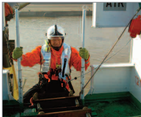
• MIRG “Fall Arrest” equipment in use (during evaluation at Humberside)