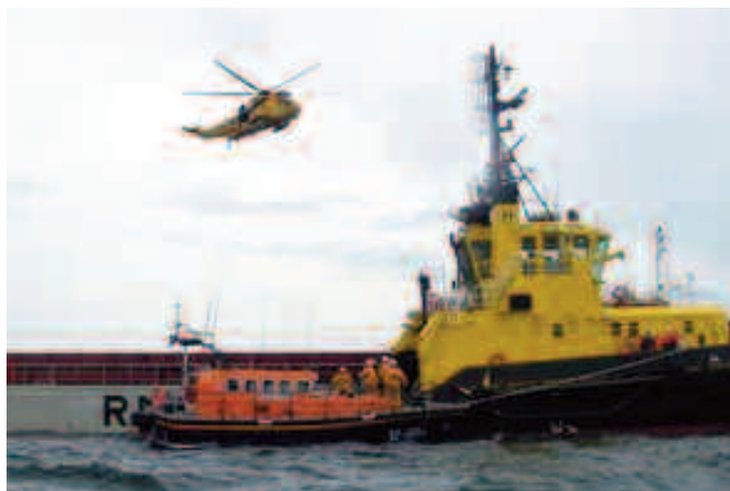
• Tug "HT Blade" and Cromer's RNLI lifeboat

Additional teams of firefighters from Lincolnshire FRS MIRG team were also put on stand by. A Command structure was established at Yarmouth MRCC and two teams from Suffolk MIRG team were transported to the incident by helicopter.